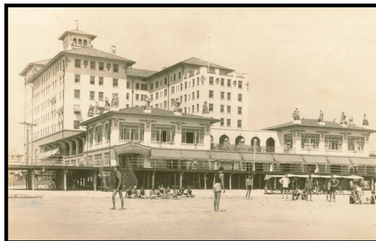
Flanders Hotel , 11th Street and Boardwalk