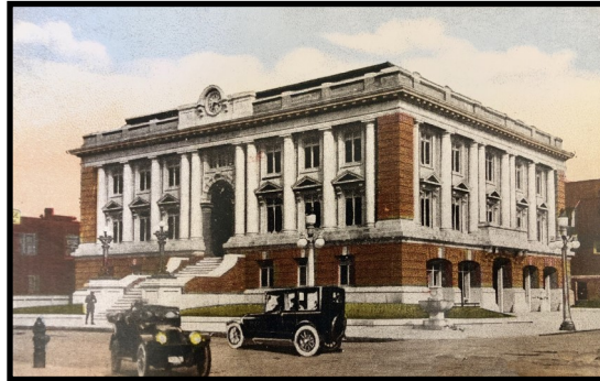
City Hall , 9th Street and Asbury Avenue