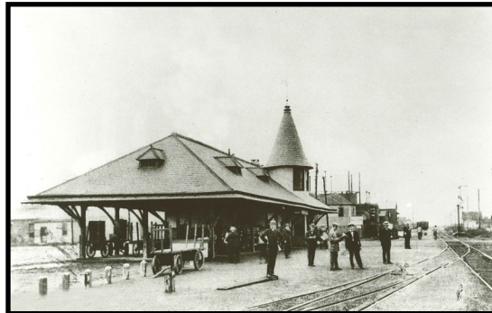
Train Station , 10th Street & Haven Avenue